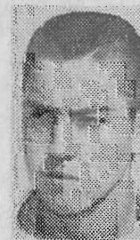
NELSON Granite Hills

In any year the Classified Ads are the best way to advertise. Telephone 233-8080.