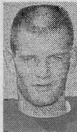
LUSCOMB Mt. Miguel