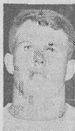
DE LONGE El Cajon