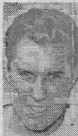
TRAUNERO Mt. Miguel