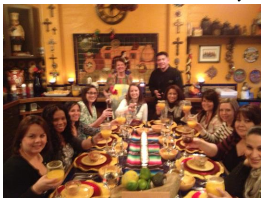
Cooking Class at Tina's Cocina